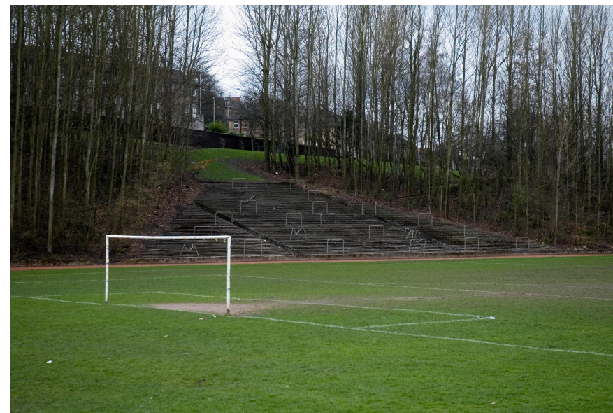
Cathkin Park Football Stadium

In 1903 Queen's Park moved to their third (and current) Hampden Park. Third Lanark bought second Hampden Park, and renamed it New Cathkin Park. There they stayed, until their demise under dubious financial circumstances in 1967. Cathkin Park is now owned by