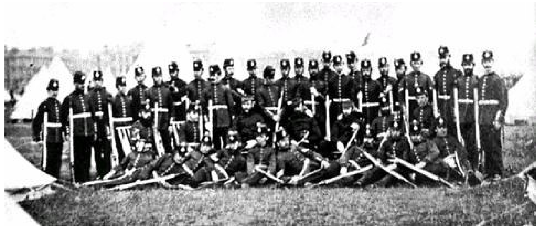
3 rd LRV Camp of Instruction at Queens Park, 1873

In 1875 the club moved to Old Cathkin Park in Govanhill, a site provided by Dixon's Blazes, the famous iron foundry. A grandstand was built, and a Scotland-England international was played there in 1884. Scotland won 1-0, watched by a crowd of 10,000.